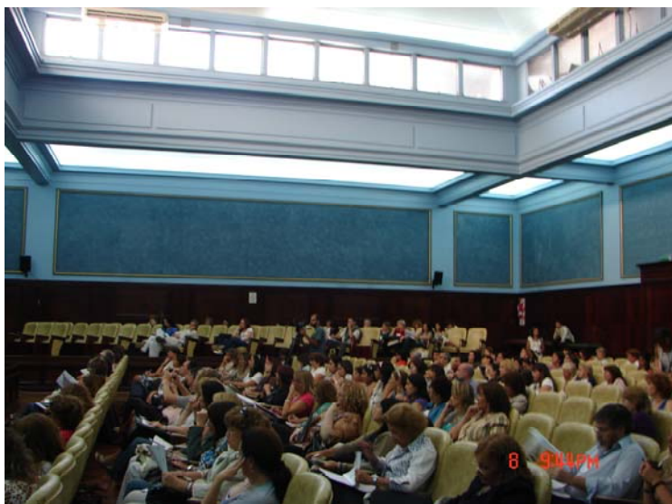
Auditorium (Aula magna)